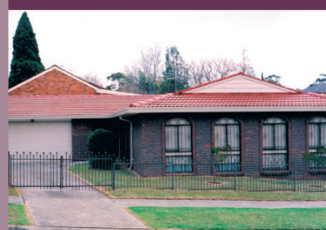
'Lixouri House' North Ryde NSW