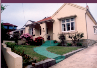
'St Andrews House' Gladesville NSW

Email: admin@estia.org.au | Telephone: (02) 9879 8000