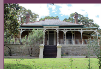
'Kyle Williams House' Blakehurst NSW

Head Office: 5-7 Pearson Street Postal Address: PO Box 17 Gladesville NSW 1675